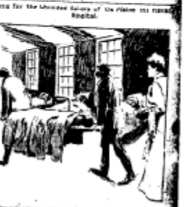
Scene in the Hospital.

Madrid Not Yet Here. The British cabinet has decided to support the United States in its demand for the return of the Maine to Havana harbor.