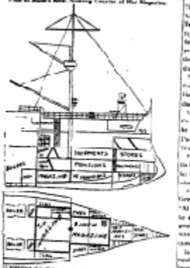
Plan of Maine's Bow, Showing Position of Various Compartments.

Washington, Feb. 16.—The President has called a special meeting of the Cabinet at 10 o'clock this morning. It is believed that the President has called the Cabinet to discuss the situation in Havana, and to consider the possibility of sending a fleet to the city.