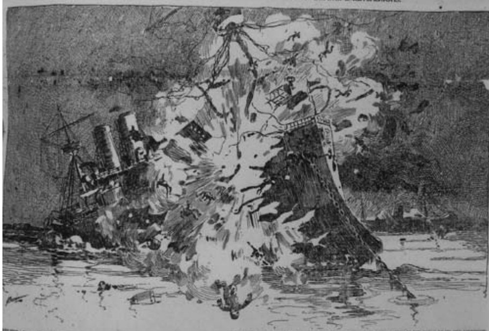
THE WRECKAGE OF THE CITY OF WASHINGTON WAS FOLLOWED BY A TIDE OF PUBLIC OPINION OF SUCH A NATURE AS TO HAVE CAUSED BY THE END OF FEBRUARY TO BE SENT TO HAVANA, CUBA, TO INVESTIGATE THE CAUSE OF THE EXPLOSION. THE WRECK STORY OF THE MAINE TOLD IN A FEW WORDS. The City of Washington was a steamship of 10,000 tons, built in 1892, and was on her way from Havana to New York on Feb. 15, 1906. She was carrying 260 men and 2,000 tons of munitions. She was blown up by a bomb or torpedo, and the cause of the explosion is still a mystery. The captain, Sigsbee, and the consul-general, Lee, are in doubt as to the cause of the explosion. The world has sent a special tug, with submarine divers, to Havana to find out. Lee asks for an immediate court of inquiry. Washington officials are ready for vigorous action if Spanish responsibility can be shown. Divers will be sent down to make careful examinations. The explosion of the City of Washington is one of the most mysterious disasters in the history of the United States. The ship was on her way from Havana to New York on Feb. 15, 1906. She was carrying 260 men and 2,000 tons of munitions. She was blown up by a bomb or torpedo, and the cause of the explosion is still a mystery. The captain, Sigsbee, and the consul-general, Lee, are in doubt as to the cause of the explosion. The world has sent a special tug, with submarine divers, to Havana to find out. Lee asks for an immediate court of inquiry. Washington officials are ready for vigorous action if Spanish responsibility can be shown. Divers will be sent down to make careful examinations. The explosion of the City of Washington is one of the most mysterious disasters in the history of the United States. The ship was on her way from Havana to New York on Feb. 15, 1906. She was carrying 260 men and 2,000 tons of munitions. She was blown up by a bomb or torpedo, and the cause of the explosion is still a mystery. The captain, Sigsbee, and the consul-general, Lee, are in doubt as to the cause of the explosion. The world has sent a special tug, with submarine divers, to Havana to find out. Lee asks for an immediate court of inquiry. Washington officials are ready for vigorous action if Spanish responsibility can be shown. Divers will be sent down to make careful examinations.