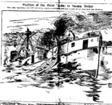
Position of the Maine Today in Havana Harbor.

England Believes It Full Play. The British cabinet has decided to support the United States in its demand for the return of the Maine to Havana harbor.