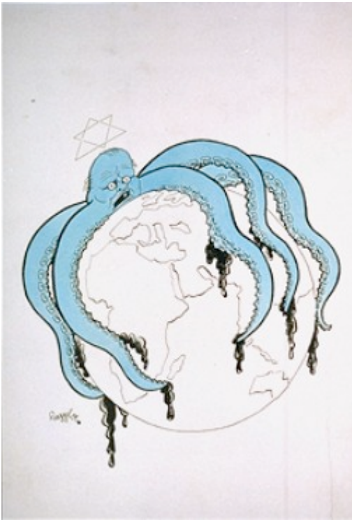
Anti-semitic cartoon by Seppia (Josef Plank) An octopus with a Star of David over its head has its tentacles encompassing a globe. Date: Circa 1938