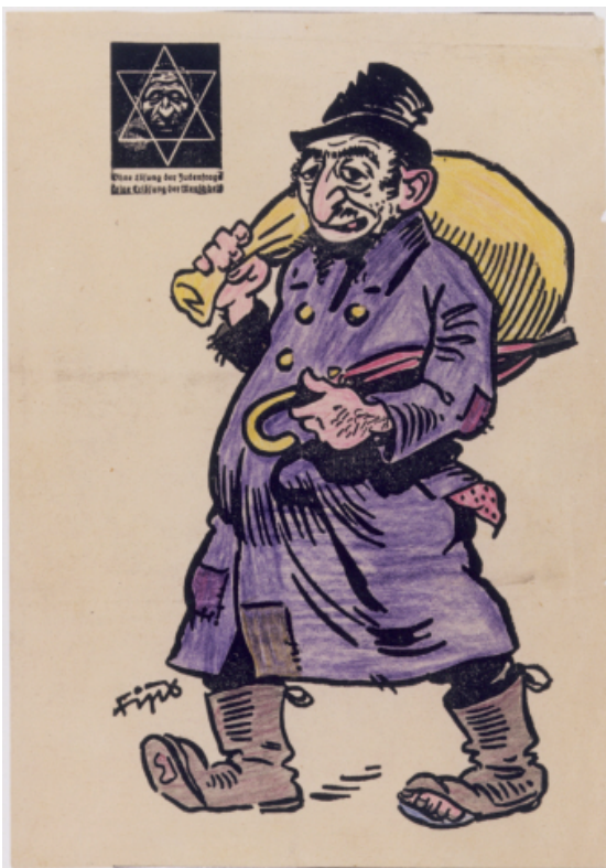
A page from an antisemitic coloring book featuring a portrait of a Jew drawn by the German caricaturist known as Fips. [Photograph #42034] The caption at the bottom of the page asks "Do you know him?" In the upper lefthand corner is the der Stummer logo featuring a Star of David superimposed over a caricature of a Jewish face. The caption under the star states that "without a solution to the Jewish question, there will be no salvation for mankind."